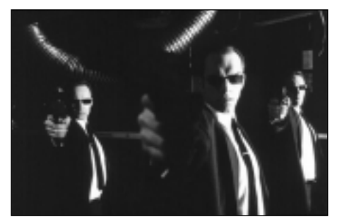
• Watching The Matrix (1999).

The context for the third type of emotions, world emotions, is a set of norms and rules we might call world principles. These wide-ranging principles can be as basic as laws of science (e.g., gravity) and as complex as cultural norms (e.g., gender norms). Our emotional responses crucially rely on our understanding of these principles. Consider a fantasy film, such as a vampire movie. One of the typical world principles of these films is that vampires burst into flame when forced into sunlight. A viewer who wants the vampire to die, and who understands this principle, will be relieved when the vampire is suddenly thrust into sunlight. If the viewer does not know that world principle, then he will be very surprised when the vampire